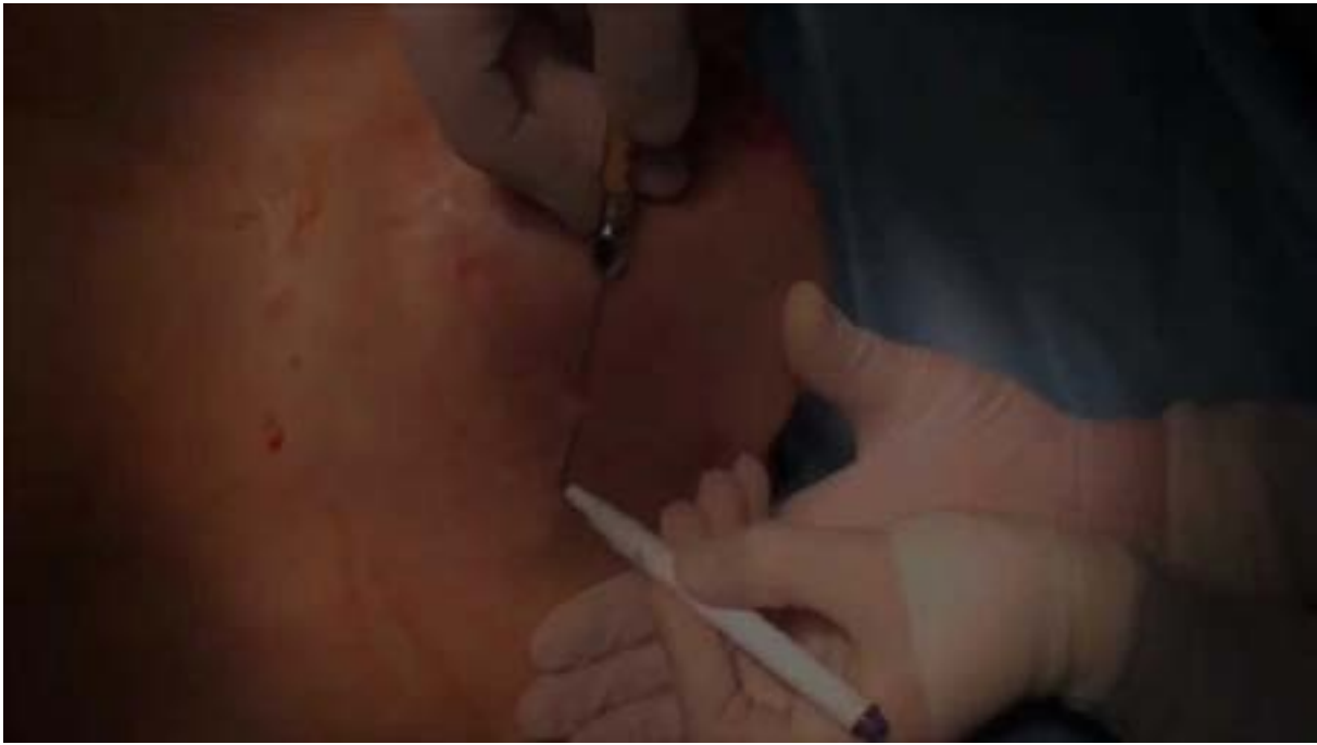
Video: Movie of the fat graft injection performed by Gentle Technique in patient affected by outcomes of breast reconstruction

Then the graft was injected through periareolar entrances located at 45°–135° and 225°–315° on the areolar circumference. If required, we place an additional third access at 12 o'clock. The fat was injected using 1–2 cc syringes through three or four tunnels arranged radially around the skin access and released with a retrograde technique while withdrawing the cannula along linear deposits within and over the mammary gland. We generally use an inferior number of tunnel for these access then the number we used for the inframammary ones because this graft is not used to fully the breast but just to refine breast contour and skin irregularities. The quantity of fat injected through these accesses is about 50–70 cc, according to the breast needs.